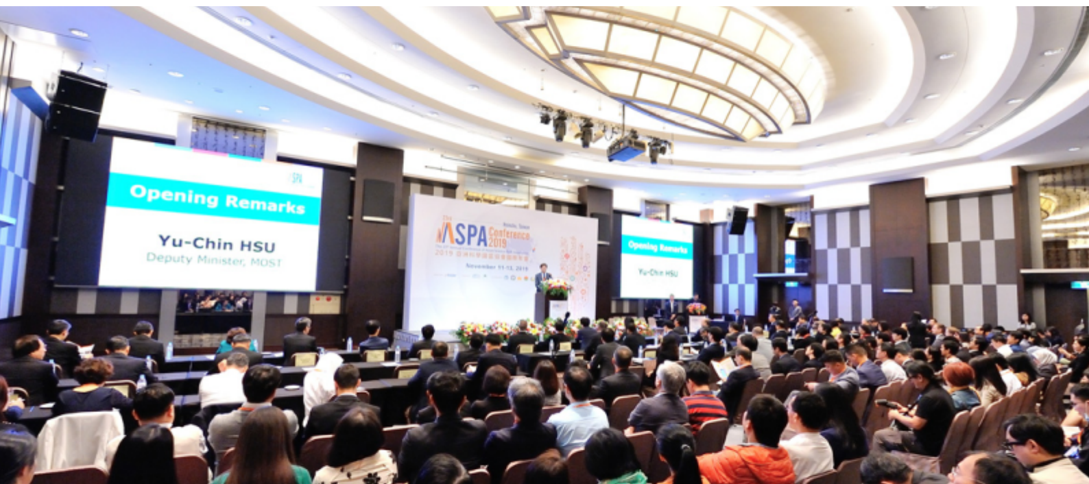
23rd ASPA Annual Conference 2019 in Hsinchu, Taiwan Organizer: Hsinchu Science Park